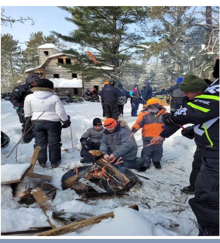
Participants enjoy roasting hot dogs at the campfire - White Otter Castle