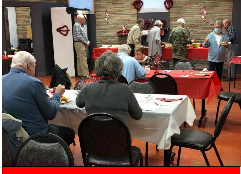
Silver Tops Valentine's Potluck – a REALLY good supper!